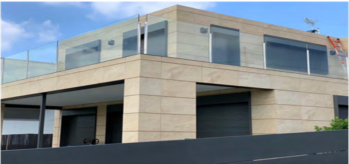
Figure 2 Installed product

The results of the sizes associated with the highest and lowest environmental impact show deviations of more than 10% from the weighted average. Annexes I and II show the environmental impact results of the reference with minimum and maximum impact values respectively.