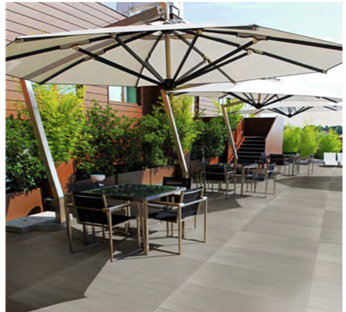
Figure 5 Installed product

The environmental burdens and benefits of obtaining secondary material from waste generated at the manufacturing stage (waste such as cardboard, plastic and wood), at the installation stage (tile waste, tile packaging waste: cardboard, plastic and wood) and at the end of life of the product have been considered.