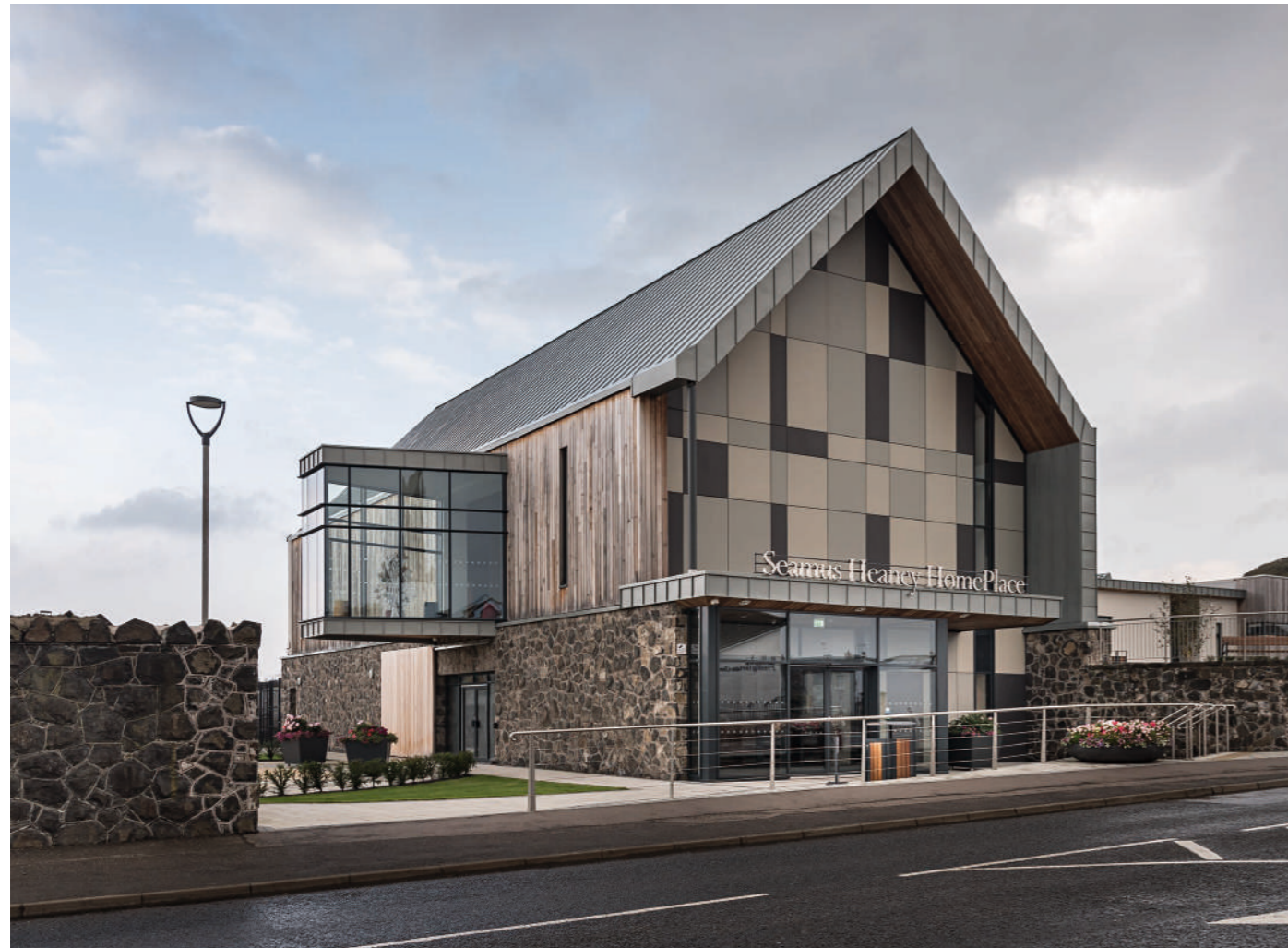
Seamus Heaney Home Place, Bellaghy, Northern Ireland. Architect: W M Given, Coleraine, Great Britain.

Nobilis is a large format fiber cement panel with a translucent lightly pigmented surface coating. Select color tones highlight the authenticity of the fiber cement.