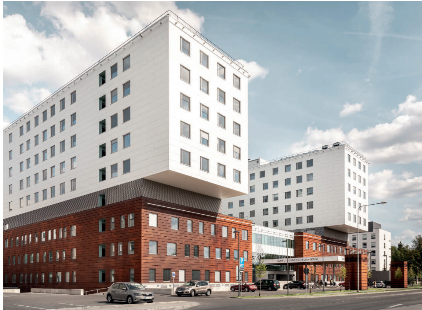
Tartu University Hospital, Tartu, Estonia. Architect: AW2 Architects, Helsinki, Finland.

Carat is a through colored fiber cement panel with a translucent lightly pigmented finish. The unique natural look and timeless beauty of the monolithic material ensure a distinguished expression.